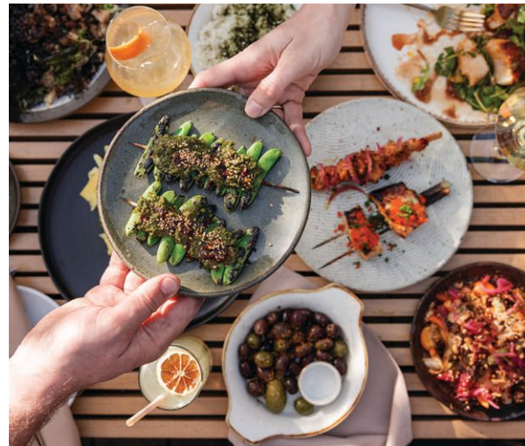
Isla's snap pea skewers with yellow koji, chili oil and mint

Indulge in yakitori-style cuisine just steps off Santa Monica's Main St. at Isla, the sophomore concept from Crudo e Nudo chef Brian Bornemann and artist/designer Leen Culhane. The duo's second restaurant project is infused with coastal profiles from California and the Mediterranean. Diligently using local ingredients, the intimate dining destination features dishes including winter citrus topped with caper berries and charred meyer lemon, roasted whole cauliflower with garlic tahini dressing and bottarga and a white miso black cod—which all make excellent pairings to Isla's low intervention wine and cocktail program. isla-la.com